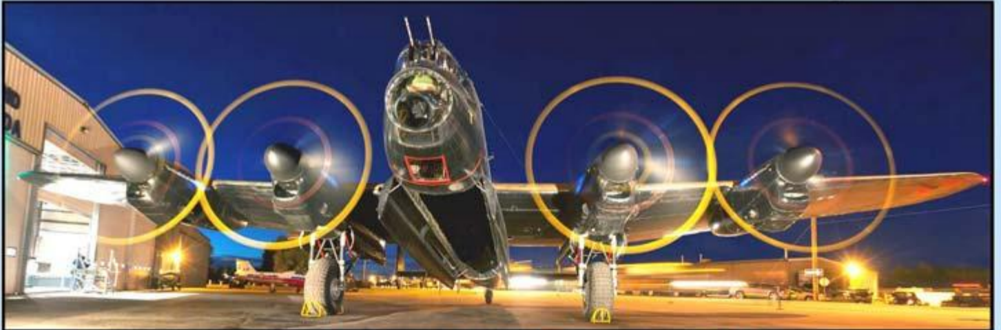
THE IAN BAZALGETTE MEMORIAL LANCASTER

Join us at the Bomber Command Museum as we commemorate the Victoria Cross flight of the only Albertan awarded the VC during World War II.