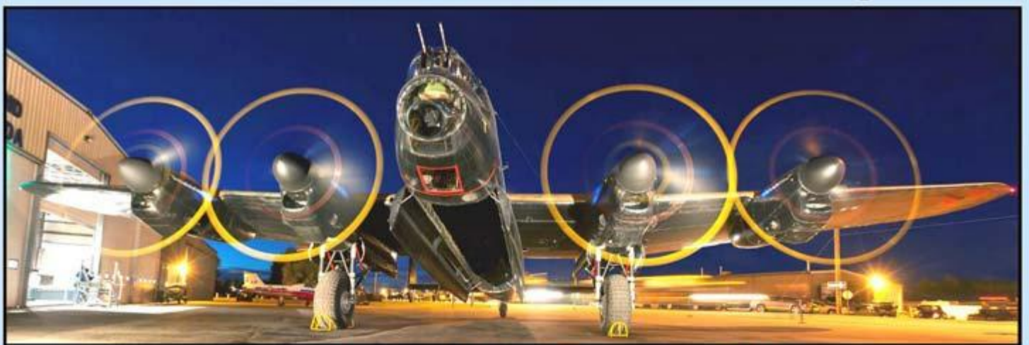
THE IAN BAZALGETTE MEMORIAL LANCASTER

Join us at the Bomber Command Museum as we commemorate the Victoria Cross flight of the only Albertan awarded the VC during World War II.