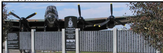
The names of the 10,670 Canadians who were killed are listed on Canada's Bomber Command Memorial.

We encourage you to forward this bulletin to others who you feel may be interested.