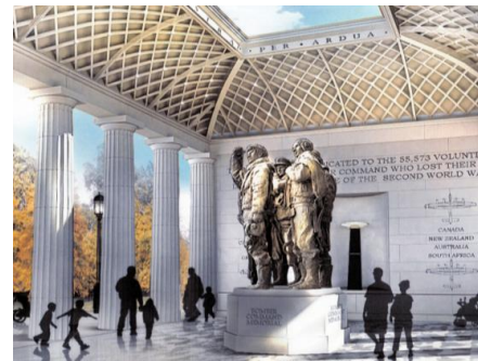
The focal point of the Bomber Command Memorial