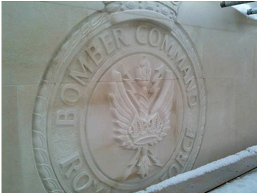
A portion of the Memorial's central area.

Visit http://www.bombercommand.com/in-the-press/memorial-update-5 for a recent update on the Bomber Command Memorial website that features a report regarding our aluminum and numerous photos and links.