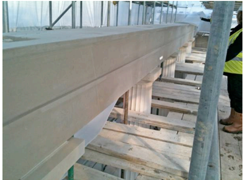
A portion of one wing of the Memorial from the third level of scaffolding.

The Bomber Command Museum of Canada and others are encouraging the Government of Canada to play a prominent and appropriate role at the Dedication which will be a major and significant event.